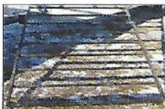
R3 - Add Sled Ramp to Middeck