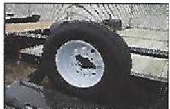
SP1 - Spare Tire & Rim

RD Rear Drop Legs TC Trickle Charge Breakaway Battery Upgrade NW No Wood T4 Upgrade to 2' Stationary & Tilt (QS Only) AL 24" Aluminum Shields DOS Drive Off Shields AP Add Stake Pockets XF1 Extra Footage BR1 Bump Rail (for Sled)