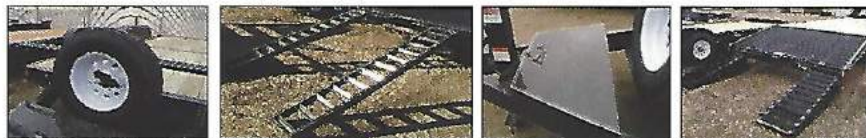
SP1 - Spare Tire & Rim R7 - 7' Slide In Ramps TB1 - A Frame Toolbox BT2 - Beavertail With Centre Lift & Spring Assist Ramps