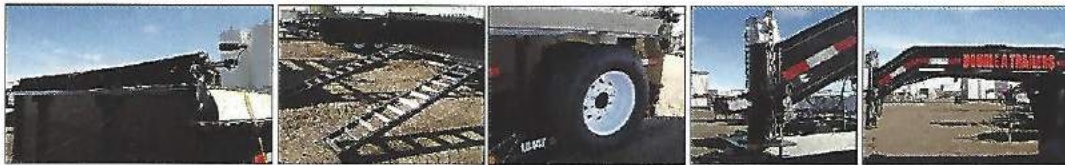
MT7 - Mesh Tarp Package R7 - 7' Slide in Ramps SP3 - Spare Tire & Rim GNKC - Gooseneck Kingpin Coupler GN2 - Gooseneck